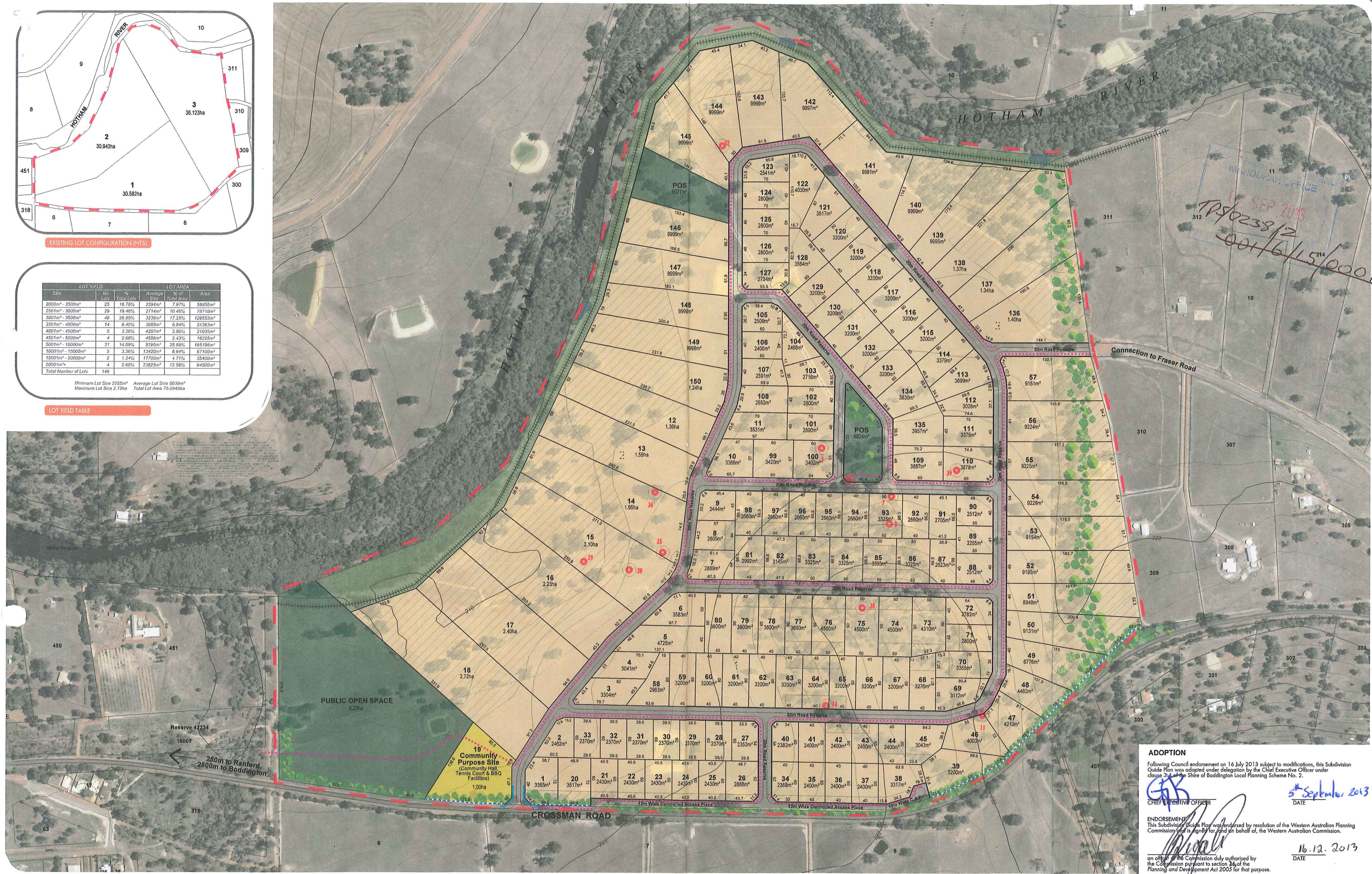
LOT YIELD TABLE

ADOPTION Following Council endorsement on 16 July 2013 subject to modifications, this Subdivision Guide Plan was adopted under delegation by the Chief Executive Officer under clause 3.4 of the Shire of Boddington Local Planning Scheme No. 2. [Signature] CHIEF EXECUTIVE OFFICER 5 th September 2013 DATE ENDORSEMENT This Subdivision Guide Plan was endorsed by resolution of the Western Australian Planning Commission pursuant to section 14 of the Planning and Development Act 2005 for that purpose. [Signature] 16.12.2013 DATE